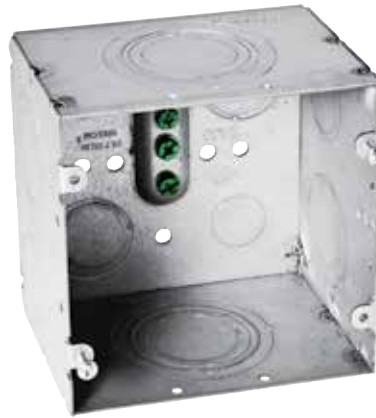
HBL260 Large Capacity Wall Box (66.7 cu. in.)