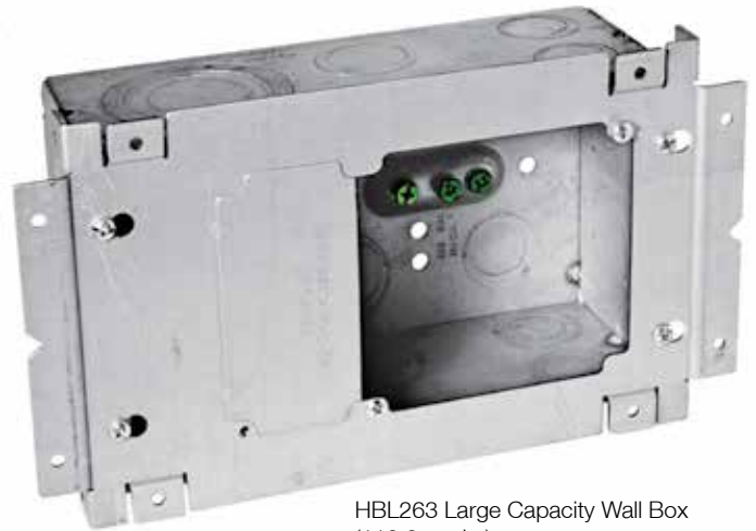
HBL263 Large Capacity Wall Box (113.3 cu. in.)